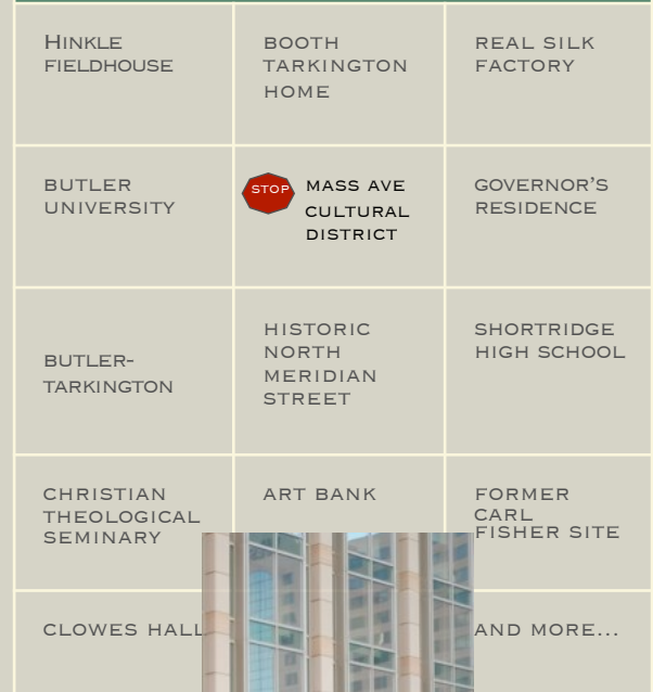
INDIANA CONVENTION CENTER