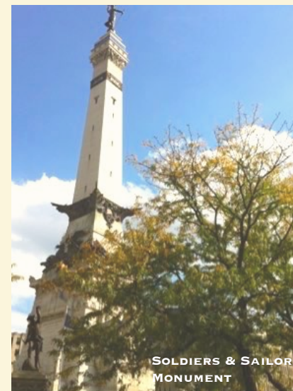
SOLDIERS & SAILORS MONUMENT