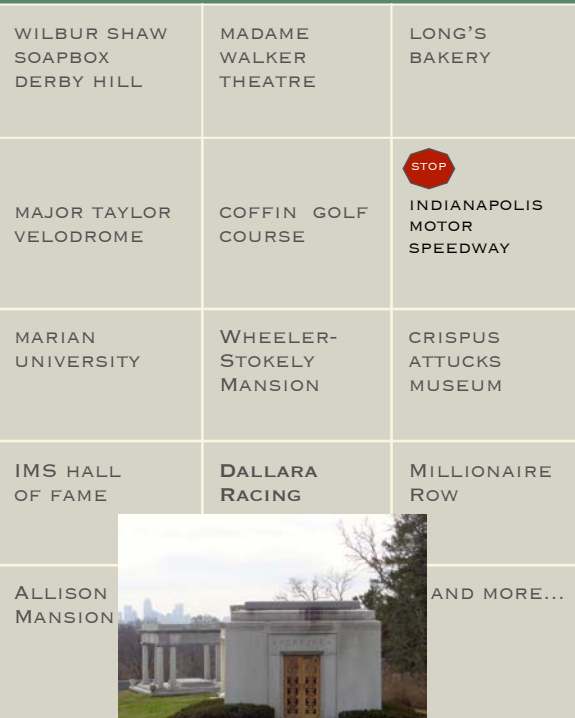
CROWN HILL CEMETERY