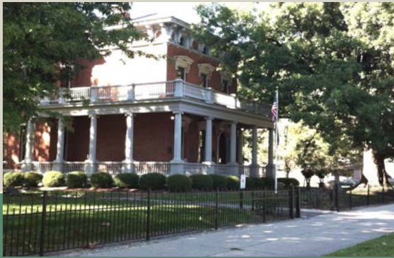
PRESIDENT BENJAMIN HARRISON HOME