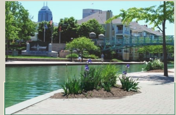
USS INDIANAPOLIS MEMORIAL DOWNTOWN CANAL